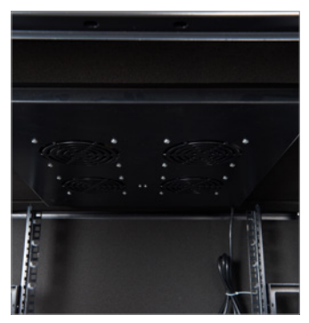
4 Way Roof Mounted Fan Tray available