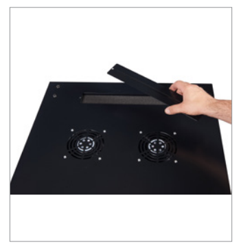
Cable Entry Gland Plates