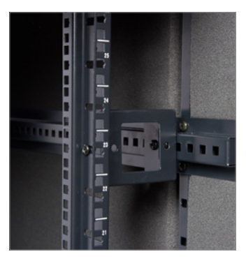
Adjustable Vertical Mounting Profiles