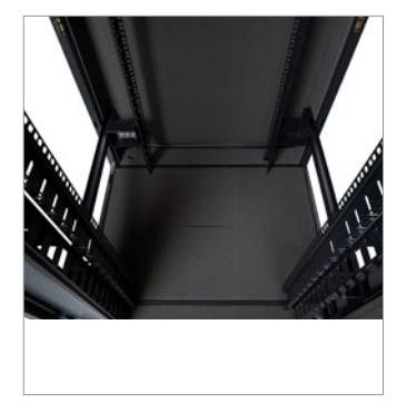
All Round Access