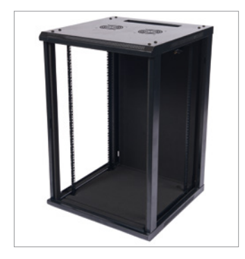
All Round Access