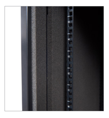
Printed U Vertical U Markers