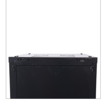
One Man Install Mounting Bracket