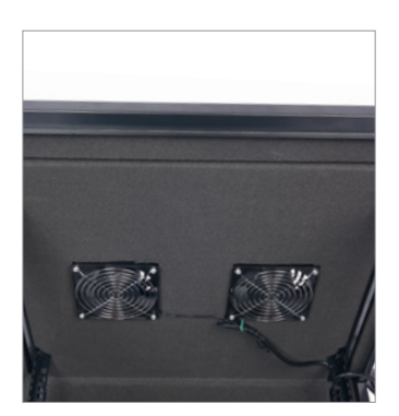
Fan Units available