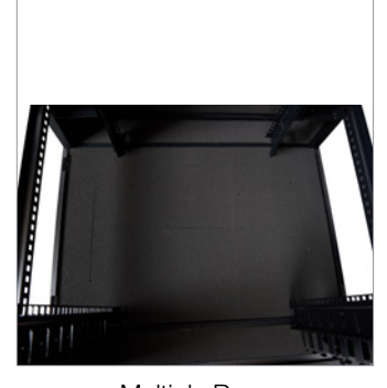
Multiple Base Cable Entry