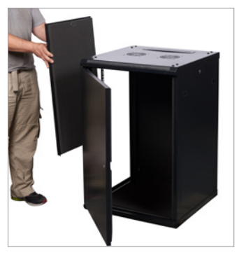
Removable & Lockable Side Panels