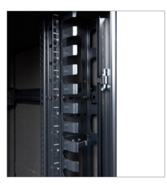
Enclosed Vertical Jumper Rings