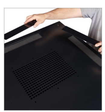
Cable Entry Gland Plates