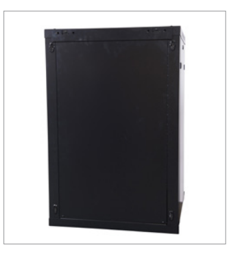
Solid Steel Back Plate