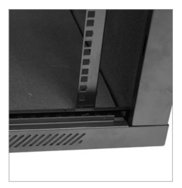
Adjustable Vertical Mounting Profiles