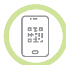
QR CODE SCANNER