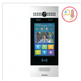
Akuvox - R29C-B SIP Touchscreen Intercom with Face Recognition, Voice Commands and Thermal Detection