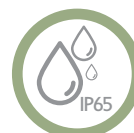
IP65 PROTECTION RATING