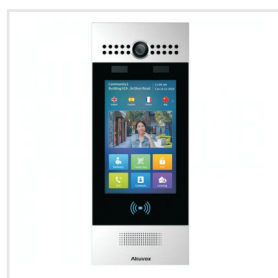
Akuvox - R29C SIP Touchscreen Intercom with Face Recognition, Voice Commands and QR Code Scanner