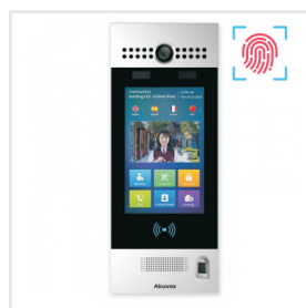
Akuvox - R29CT SIP Touchscreen Intercom with Face Recognition, Voice Commands and Fingerprint Reader